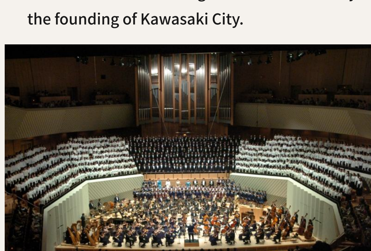
Akiyama Kazuyoshi, conductor: Mahler Symphony No. 8 'Symphony of a Thousand'.