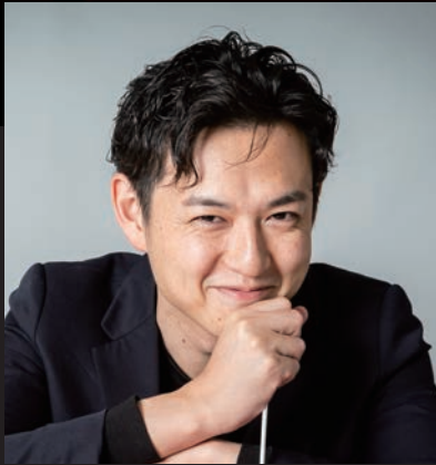
Conductor Shimpei Sasaski